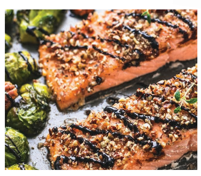
*According to the Food and Drug Administration, research suggests (but does not prove) that eating 1 1/2 ounces of most nuts, such as pecans, each day as part of a diet low in saturated fat and cholesterol may help reduce your risk of heart disease. One serving of pecans (28 grams) contains 18 grams unsaturated fat and only 2 grams saturated fat.

Heart smart* content connects the nutrition interests of our target audience with easy-to-create weeknight recipes. "Crusted salmon" had a click through rate of 5.67%, 130% higher than the average for Google advertising.