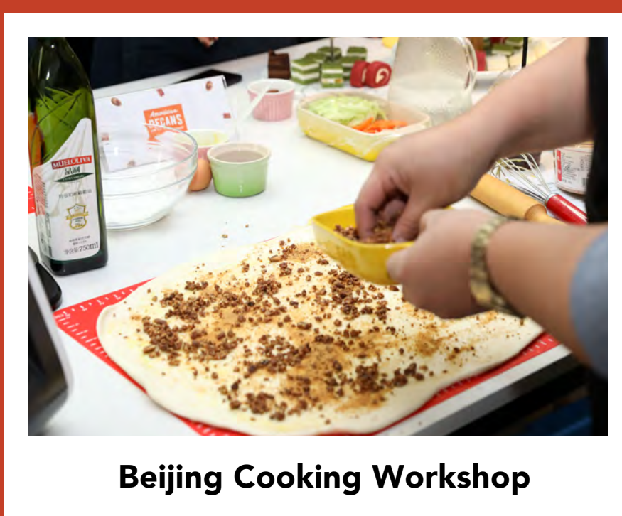
Beijing Cooking Workshop