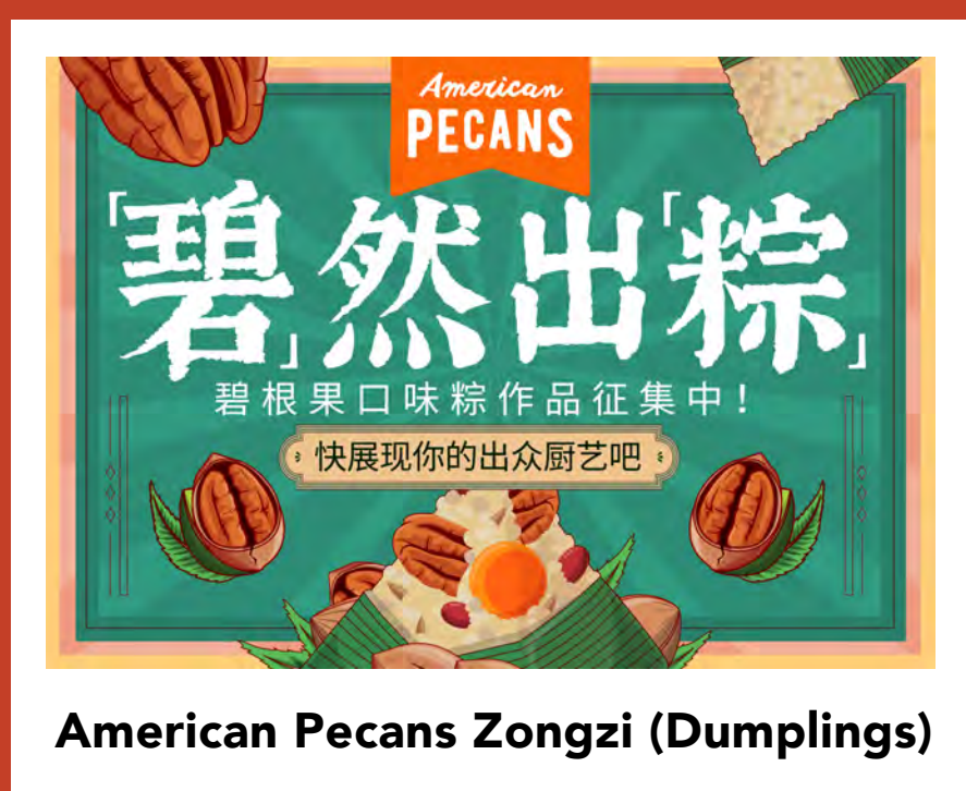
American Pecans Zongzi (Dumplings)

As we celebrate strong results in 2021, momentum in China continues into 2022 – from plans to launch American Pecans own social media presence, to hosting more consumer events, and leveraging additional KOL partnerships!